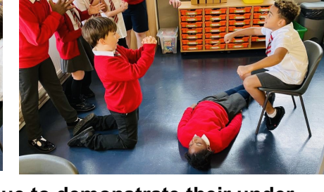
6M using freeze frame technique to demonstrate their understanding and insight into the main character of Floodlands which they are studying in English.