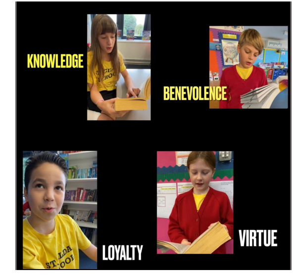
6N have worked really hard this week on assessments and have also been exploring core values; finding definitions and synonyms to truly understand how guiding principles can improve our own lives and the world around us.