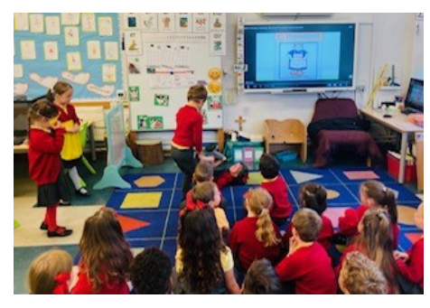
Beech Class acted out their class book 'Mrs Wishy Washy' They all enjoyed performing so much and even said their lines. They also learned some new 'Hip Hop' moves in their dance inspired PE session.