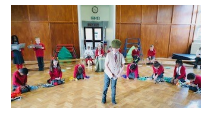
3P enjoyed performing their assembly to the school this morning. They all did brilliantly. Thank you 3P.