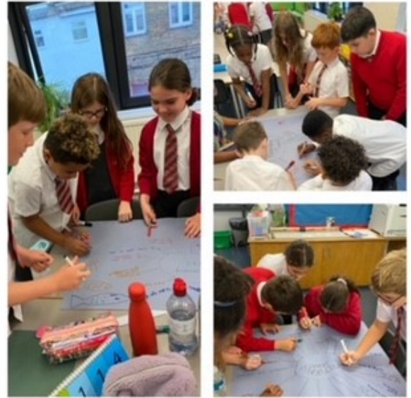
6M creating a mind map about ecosystems in the ocean.