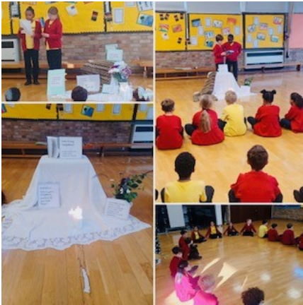
Year 4 children leading in our daily collective worship.