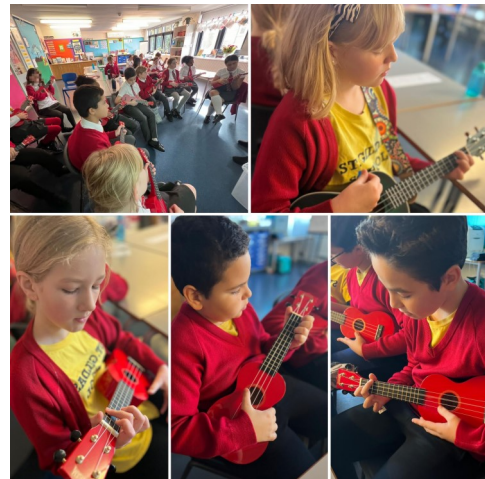
6N have been developing memory, coordination and concentration skills whilst enjoying creating music together and learning two influential hits as part of our Black History Month celebrations of the contributions Afro-Caribbean people have made to music and it's influence on the music we listen to and create today.