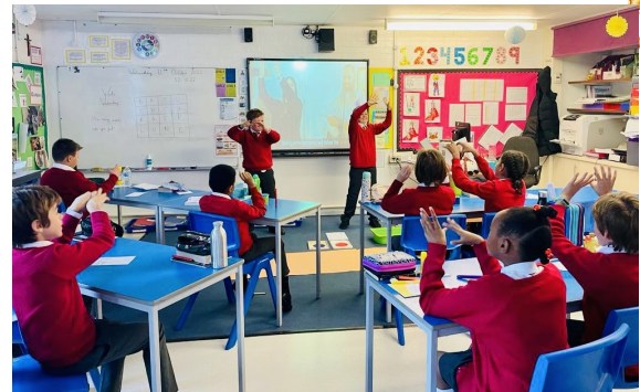
This Week members of 5M begun leading their Act of Worships for the class. 5M were respectful to their peers who took the lead this week and participated well. The rest of 5M are looking forward to leading their own ones throughout the next coming months.