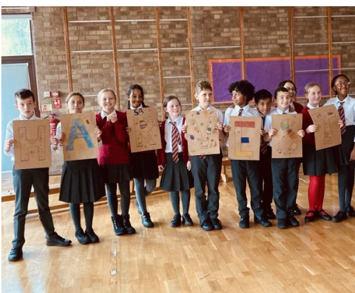
5A launched their Harvest Festival Appeal during their class assembly. The children shared the message that we are all part of God's amazing creation and that God created everything we need to live. Foods should be shared across the world and no-one should be left hungry. The children also designed their own posters to highlight their appeal.