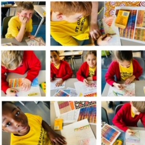
6M are learning about African fabric patterns from Zimbabwe & Nigeria in their Art lessons. They have been studying the work and life of Chris Ofili & looking at what has inspired him. Would you like to know more? Ask them!