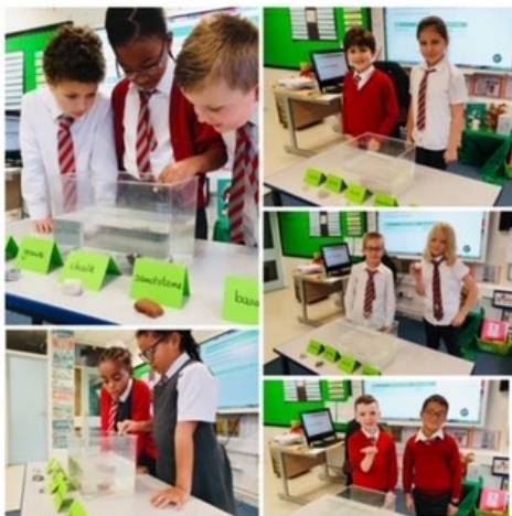
In Science this week, 3P have been investigating how porous different rocks are. We counted bubbles to see how much air could pass through each rock.