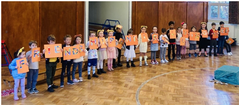
Beech Class worked very hard preparing for their assembly today which was all about the importance of friendship.