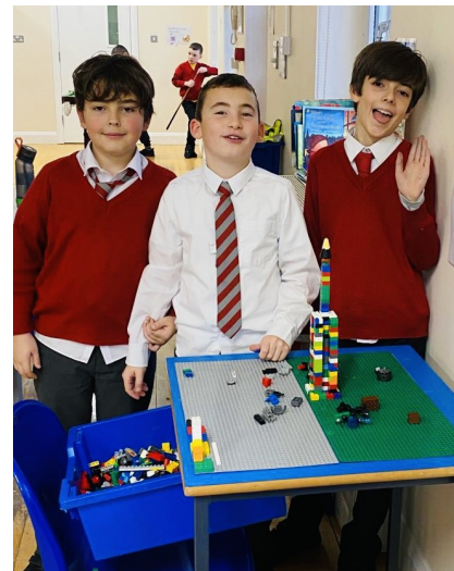
At ASC this week, the children made their own LEGO version of Burj Khalifa!