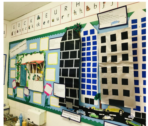
Ash class loved reading the book Anna Hibiscus by Atinuke and doing lots of writing about it.