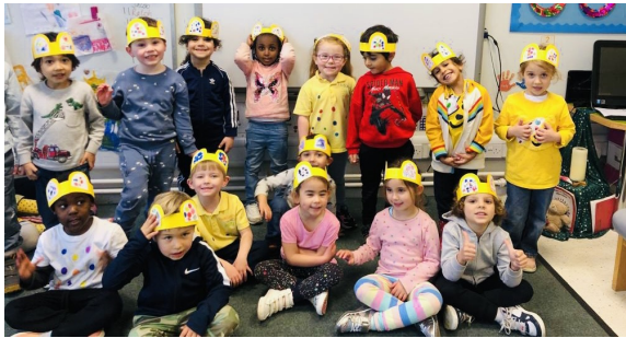
Chestnut Class had lots of fun dressing up for Children in Need and we made our very own Pudsey ears!