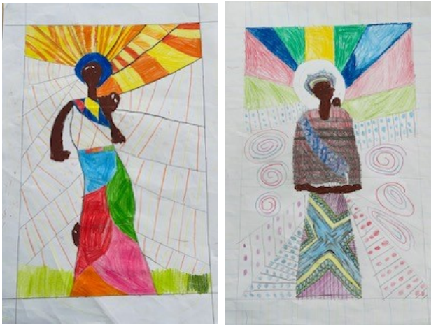
5A finished their Mama Miti artwork this week. The drawings are coloured in pencil and oil pastel, just as the illustrator of the book used. We can't wait to display our lovely colourful work!