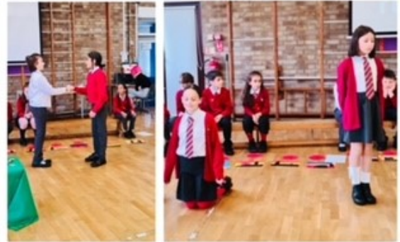
5M finally got to share their assembly which had been postponed. Moving and thought provoking we remembered those who have died during war.