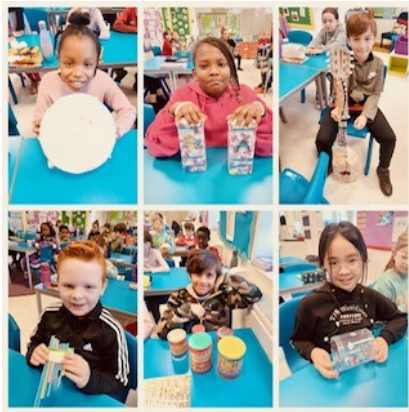
In 4T we made musical instruments to go along with our story 'The Village that Vanished'