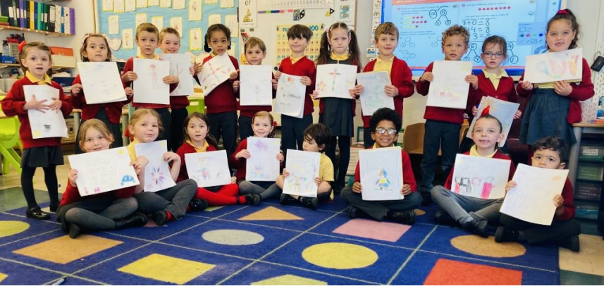
In Beech Class this week we used regular 2D shapes to create a picture and labelled all the shapes we used.

Chestnut class enjoyed a special visit from the Hand Hygiene Team. The School Nurses taught us about the importance of handwashing and how to wash our hands properly.