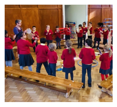
Ash Class had lots of fun practising their Harvest songs and playing different instruments. They sounded pretty good too!!