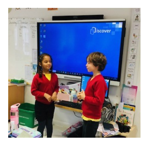
This week 4T have been trying their hand at oral story telling.