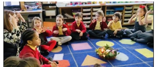
Beech Class had a busy week preparing for the start of Advent. They made beautiful window displays for the Living Advent Calendar and also made their class Advent wreath.