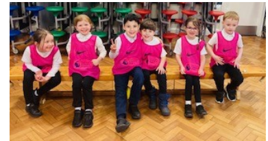
Beech Class have been honing their teamwork skills, with a fabulous dodgeball session in PE.