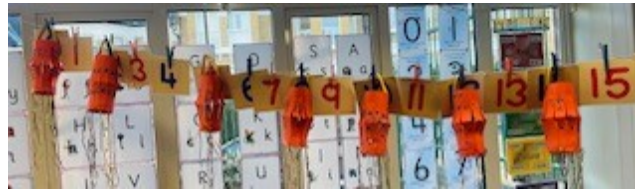
In Chestnut Class, we made lanterns for Lunar New Year.