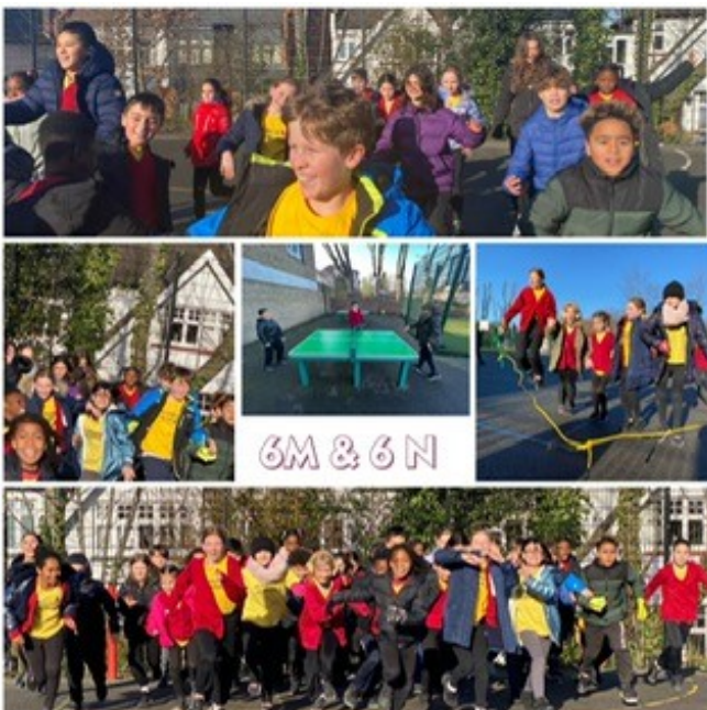
Year 6 have enjoyed the Winter sunshine and fresh air together. Using extended playtime and P.E sessions we have exercised and played outdoor games gearing up for assessment week next week!

5A learned a valuable lesson in difference when we all had 10 minutes to draw a bird. They were the only instructions given. The results were all unique, just as we are. This was part of our RE lesson in which we were thinking how we are all called to complete God's mission, but in our unique ways. Other highlights included dramatising what life might have been like for Ernest Shackleton's men who were marooned on Elephant Island in Antarctica for several months, waiting to be rescued.