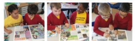
3P have been enjoying mixing paint to create different tones in preparation for still life drawings. We have also been learning to write in role as a reporter. We have looked for the 5 W's (who, what, when, why, where) in articles in the newspaper before writing our own.