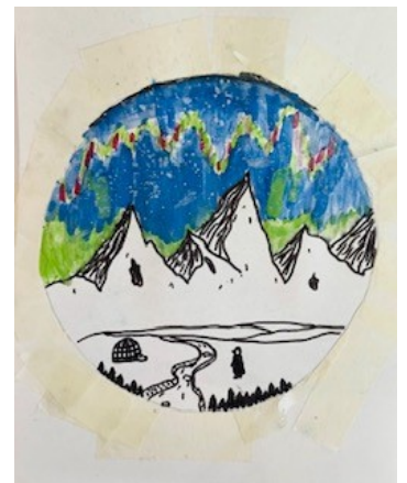
In 5M we have been inspired by the artist Jen Aranyi, creating icy landscapes based on our current English text Ice Trap.