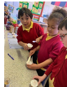
Ash Class have been very busy writing instructions. Here is the display of some of our work. We also made cakes and wrote instructions about how to make them.