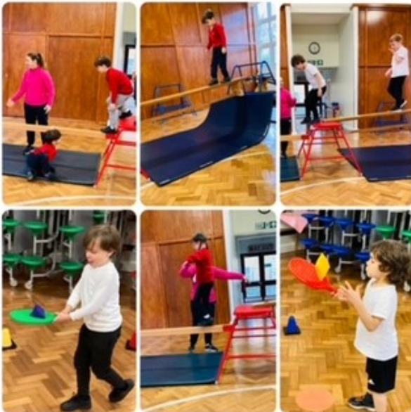
Beech Class have been practising important skills like balance and coordination in their circuits session in PE.