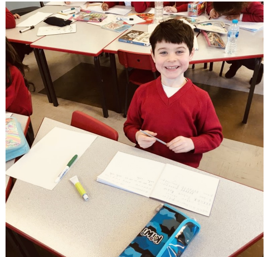
Ash Class have been working really hard on their handwriting and as you can see, they have been pleased with the results.