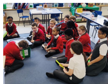
In Maths 3P have enjoyed measuring items in the classroom using different units such as millimetres, centimetres and metres.