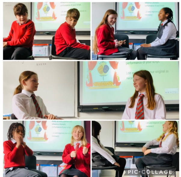
This week 6N have been writing and acting out our own play scripts.