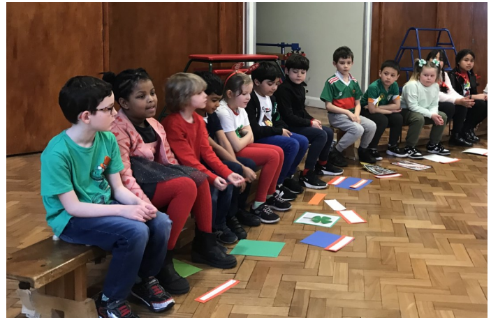
Ash Class were wonderful when they did their class assembly on St Patrick and other patron saints.