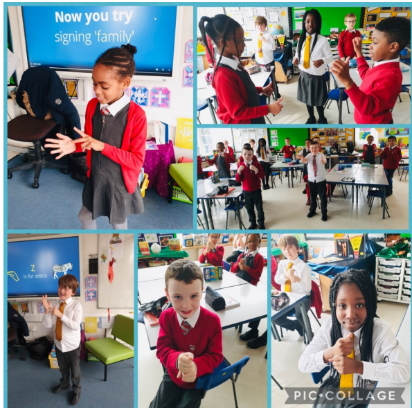
3P have enjoyed learning sign language. They tried really hard to use finger spelling to spell out their names. We also learnt lots of greetings like good morning and hello.