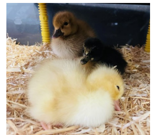
Chestnut class were delighted to get duck eggs this week and have had a great fun watching them hatch one by one. We now have three beautiful ducklings!