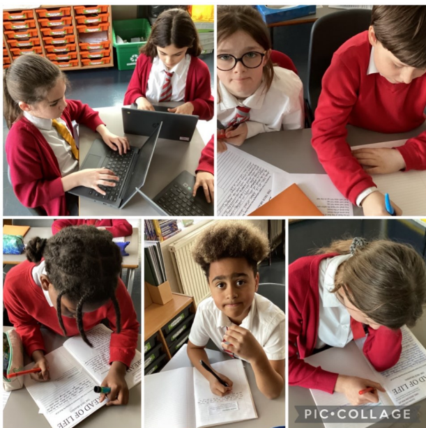
After another busy and fruitful week, 6M are continuing their hard work and excellent focus on R.E in preparation for Easter