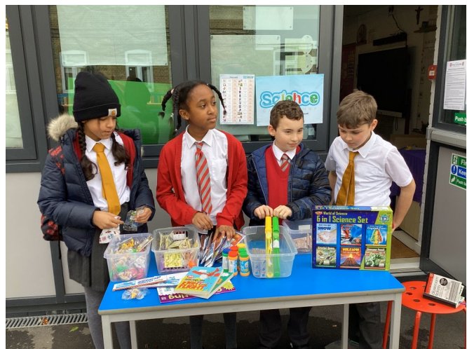
5A enjoyed their Science activities this week and especially those who got involved in selling gadgets from the gadget shop. Lots of great sales banter was noted as well as some quick mental arithmetic to work out the totals and change needed.