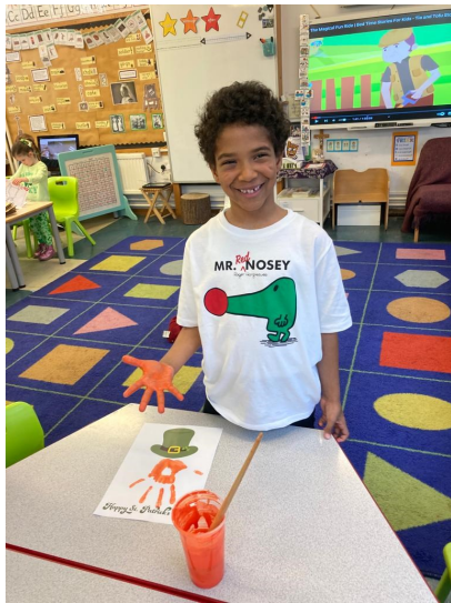
Beech Class had St Patrick's Day fun with this 'handy' art!