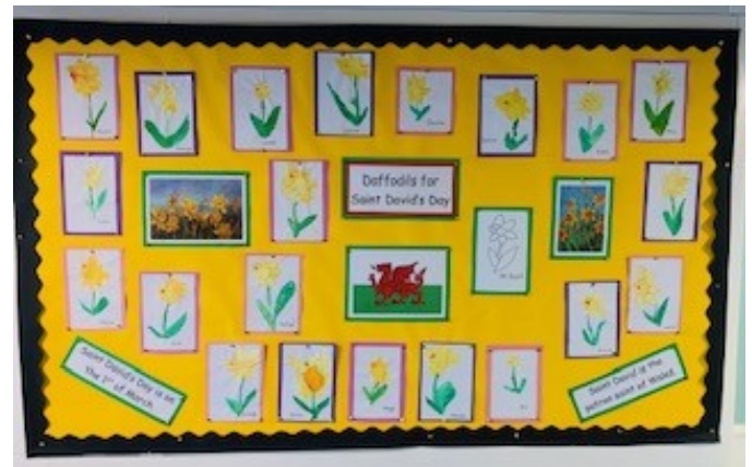
Ash Class drew and paints daffodils for Saint David's Day.