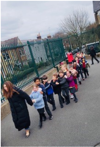
Beech Class walked around the playground for Cafod's Big Walk. We are aiming to walk 200km as a school.