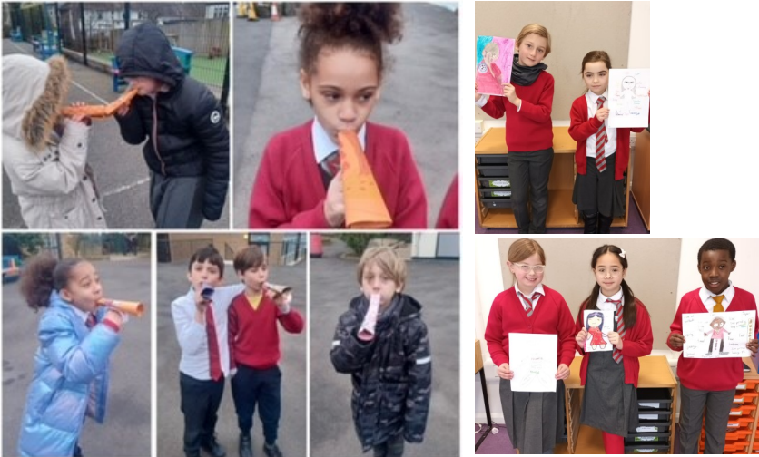
4T made their own loudspeakers in Science and tested them out in the playground. We also drew positive affirmation self portraits.