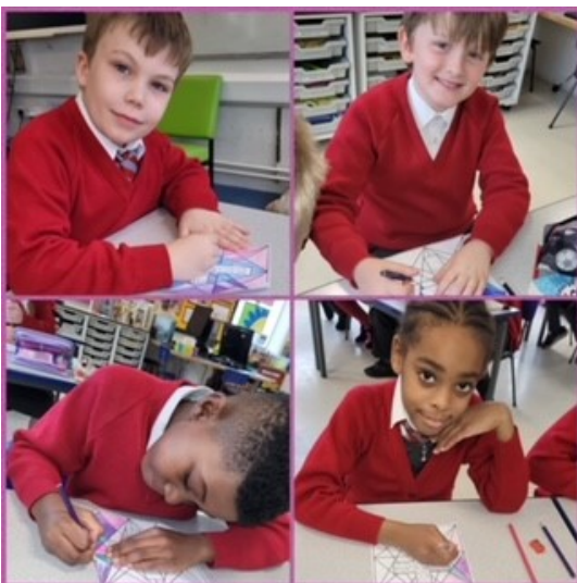
3P added the finishing touches to our Lenten promises.