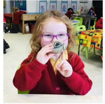
Chestnut Class made beautiful Lenten pebbles.