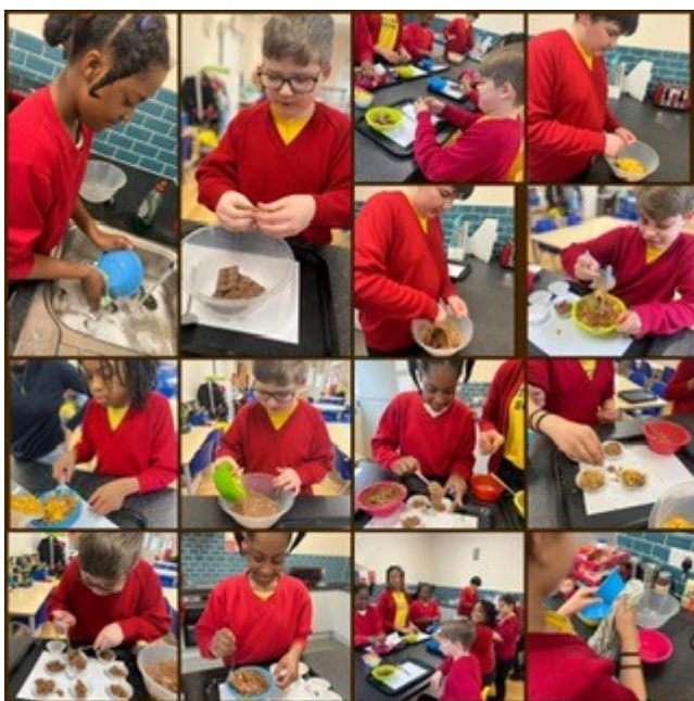
6M&N's are making great use of the After-school Club kitchen and we've made some delicious chocolate cornflake cakes to end our week of learning through fun!