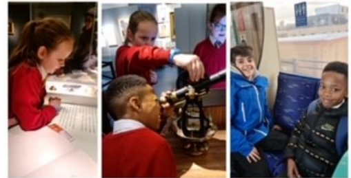
Year 5 had a fantastic trip to The National Maritime Museum. We learned so much about Ernest Shackleton and his expedition to the Antarctic.