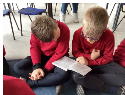
3P are enjoying their new class book Ottoline . They have made predictions about the text and created character profiles.