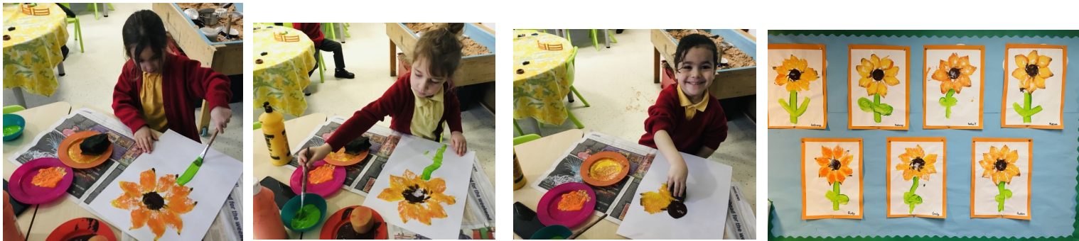
Chestnut Class enjoyed starting their new topic on Plants and painted some beautiful pictures of sunflowers.