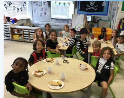
Chestnut Class enjoyed their end of year pirate party!