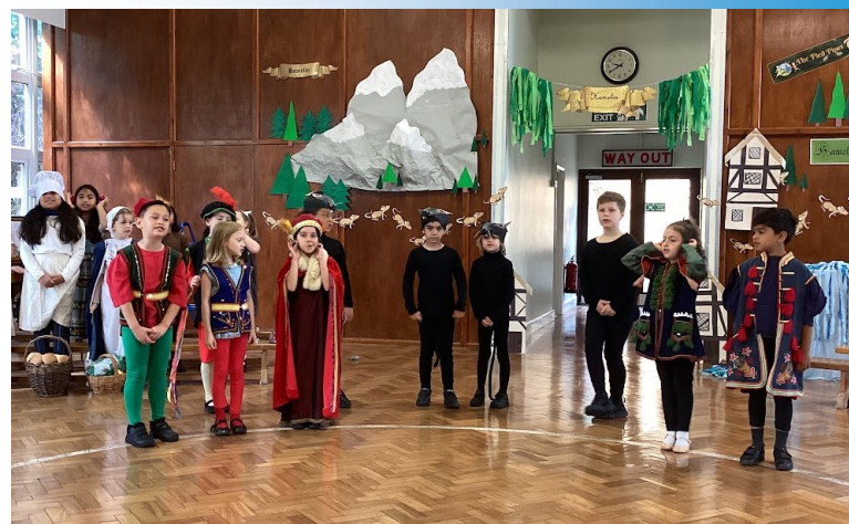
Very well done, Ash Class. They absolutely smashed it when they performed The Pied Piper to an audience. The dress rehearsal was great, the final performance to parents was even better. Loud, clear voices, lovely singing and great acting.