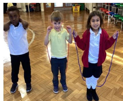
Year 1 and Reception enjoying their P.E session with our coaches, practising their bat and ball skills and rope skipping.