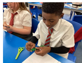
This week, Year 4 has been very busy role-playing the characters from our new book, 'Leon and The Great Between', empathising with them and predicting how the story might change them. We also generated a lot of new vocabulary to express the different emotions they might have felt. Additionally, we started our new Science topic on sounds, looking at how they're created and how we hear them. We kicked it off by making our own harmonicas, discovering how vibrations create sound waves.