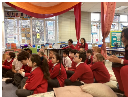
This week Year 2 have been enjoying storytelling and listening to stories. We had great fun listening to lots of stories and creating our own.