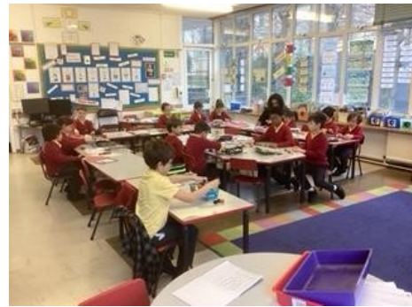
Year 2 used practical resources to support them when they were learning to do division by sharing.