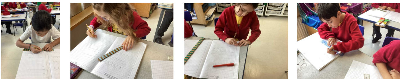
This week Year 3 have been working on measuring using centimetres and millimetres. They have enjoyed drawing different shapes accurately using specific measurements.