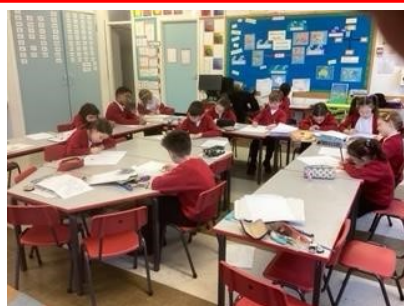
Look at that concentration because of the attention to detail. Year 2 have been sketching sunflowers in the style of Vincent Van Gogh.