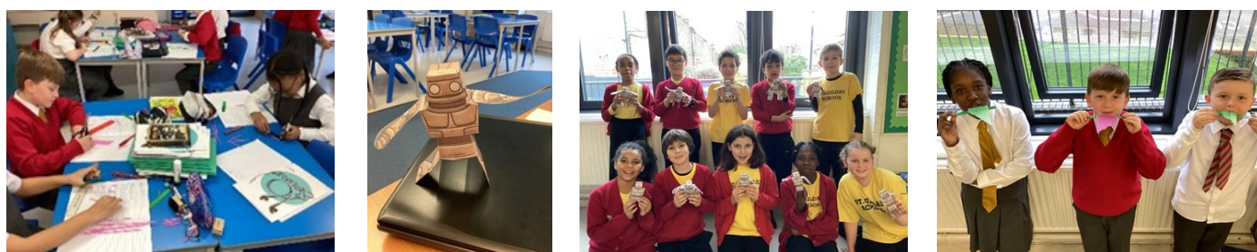
This week, Year 4 started a new unit using the novel 'The Iron Giant' by Ted Hughes. As a hook, we used our craft skills to build little iron men. Our work in on sound in Science has also continued, with us making straw harmonicas to change the pitch of a sound. We also did a hearing test to see how high a pitch we could hear. Suffice it to say, the children won that one.