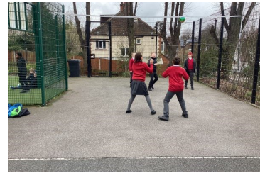
Year 5s love the new volleyball net in the playground!